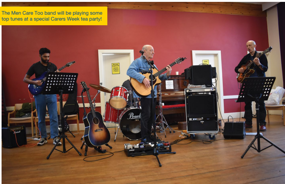
The Men Care Too band will be playing some top tunes at a special Carers Week tea party!