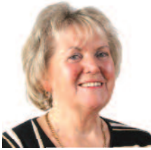
wife and carer