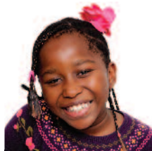
sister and carer