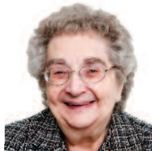
wife and carer