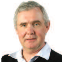
son and carer