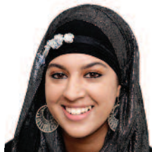
daughter and carer